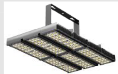
and halls of all kinds