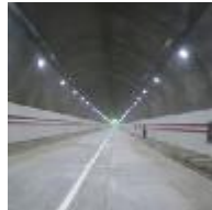
road- and Supply tunnels