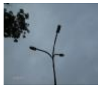
traffic circle installations