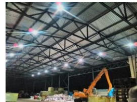
Industrie- and construction halls