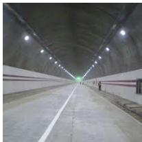
road- and supply tunnels