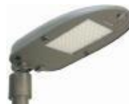
LED heads and illuminat replacment for existing lights