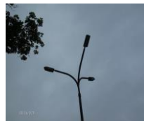
traffic circle installations