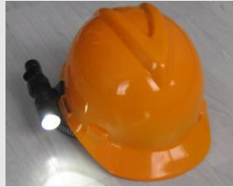
MCI BW 7300

Ex protected areas, EX endangered areas, Road tunnel and tunnel construction zones Warehouses, refineries, oil fields, service stations Petro chemistry, chemical plant, munitions factory Firework production etc. In areas of explosive products, dust, solid materials, gases Mobile lighting with little energy consumption for Fire police and emergency services