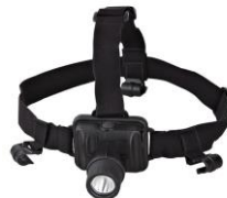
MCI BW 6310