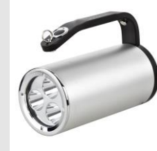
MCI BW 7101