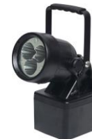
MCI BW 6610