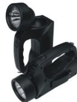
MCI BW 6210