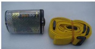
MCI BW 4100