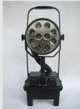
MCI BW 3210 Workinglight