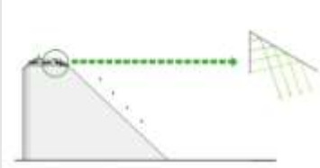
ULR: 0,0 % / 0°