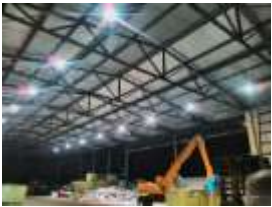
Industrie- and construction halls