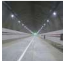
road- and supply tunnels