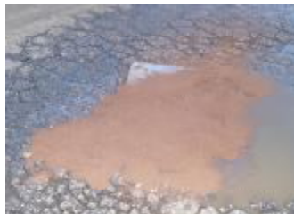
100 % Organic Fibre Oil