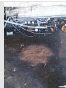
100 % Organic Fibre Oil