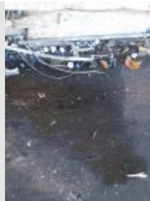
Oil on Asphalt

A 100% organic fiber sorbents with special features and quality • Easily and universally applicable! • On the water and on land • (sinks in water not from) • Pure natural (peat) • No hazard class! Non-toxic! • Absorbency 40-50 l / 7 kg • Application: in all areas such as Oil-Overcoming, transportation, agriculture, forestry and fire services, industry