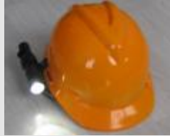
MCI BW 7300

Ex protected areas, EX endangered areas, Road tunnel and tunnel construction zones Warehouses, refineries, oil fields, service stations Petro chemistry, chemical plant, munitions factory Firework production etc. In areas of explosive products, dust, solid materials, gases Mobile lighting with little energy consumption for Fire police and emergency services