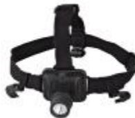
MCI BW 6310