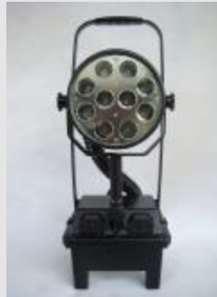
MCI BW 3210 Workinglight