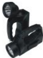
MCI BW 6210