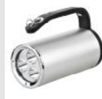
MCI BW 7101