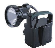
MCI BW 6200 E