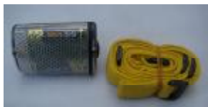
MCI BW 4100